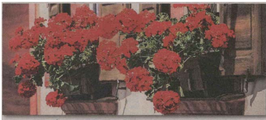
A line of red pelargoniums.

Source: Malvern Observer {Main} Edition: Country: UK Date: Wednesday 29, May 2019 Page: 10 Area: 368 sq. cm Circulation: 36648 Weekly Ad data: page rate £1,360.00, scc rate Phone: 01527 588 688 Keyword: Pelargonium