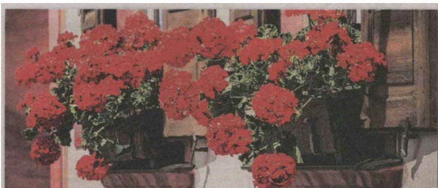
A line of red pelargoniums.

Source: Worcester Observer {Main} Edition: Country: UK Date: Wednesday 29, May 2019 Page: 10 Area: 351 sq. cm Circulation: VFD 32655 Weekly Ad data: page rate £2,040.00, scc rate £6.00 Phone: 01527 585 588 Keyword: Pelargonium